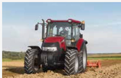
Efficient fieldwork with maximum traction.

With the addition of a Case IH LRZ loader Farmall A tractors are equipped for every loading and handling task around the farm. Loaders are easy to attach or remove and in cab controls are ideally positioned for comfortable operation.