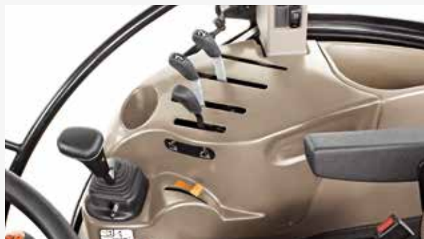
Up to three mechanical rear remote valves are available for the Farmall A range.

Mechanical fast raise/lower allows for easier and more ergonomic hitch operations with the possibility to make adjustments at any time. Pushed forward the fast raise/lower lever lowers implements to set height / depth and pulled back this lever raises implements to the value set by the height limiter.