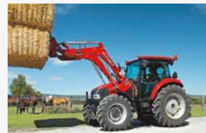
Loaders are easy to attach or remove.