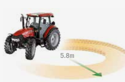
Minimum turning radius of 5.8m.